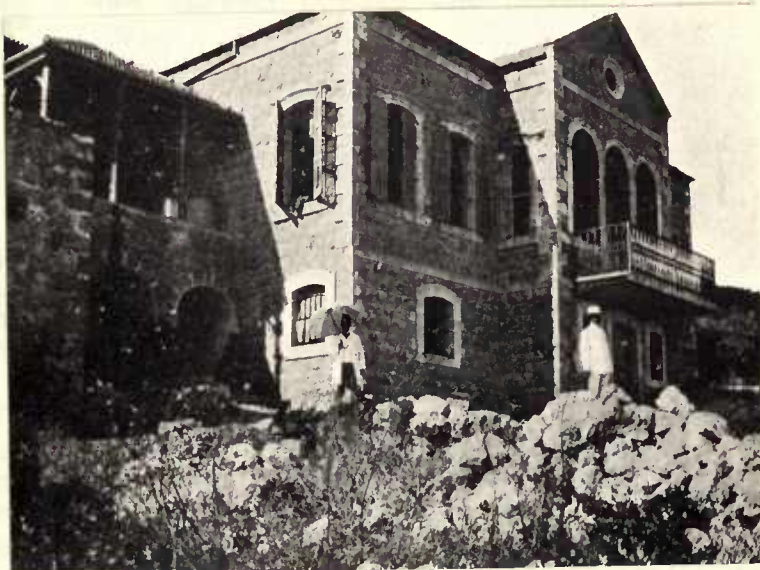
NORTH FRONT OF THE MOZAFER KHANEH