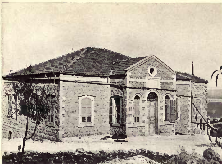
SOUTH FRONT OF THE MOZAFER KHANEH