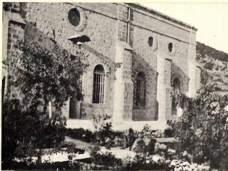
NORTH FRONT OF THE TOMB OF THE BAB