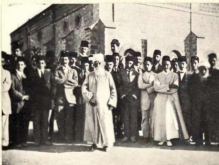
ABDUL BAHÁ AND A GROUP OF BAHÁIS AT THE TOMB OF THE BAB