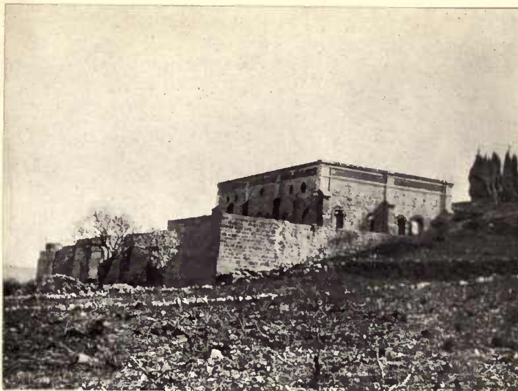
TOMB OF THE BAB ON MOUNT CARMEL