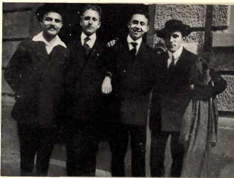
FOUR YOUNG BAHAIS OF ESSLINGEN