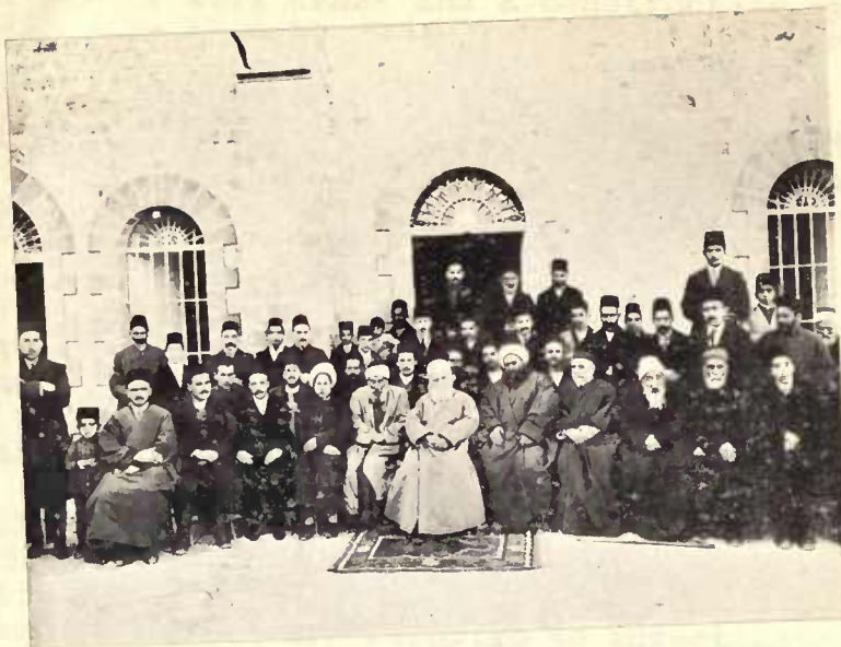
ABDUL BAHÁ WITH A GROUP OF BAHÁIS AT THE TOMB OF THE Báb