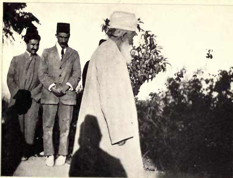
ABDUL BAHÁ WITH SOME YOUNG MEN ON MOUNT CARMEL