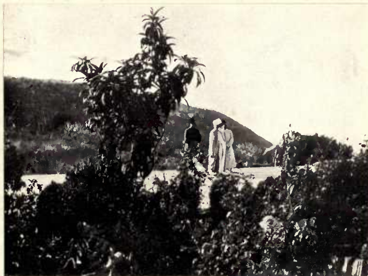
ABDUL BAHÁ WALKING ON THE TERRACE BEFORE THE TOMB OF THE BAB—THE PROMONTORY OF MOUNT CARMEL IS IN THE DISTANCE