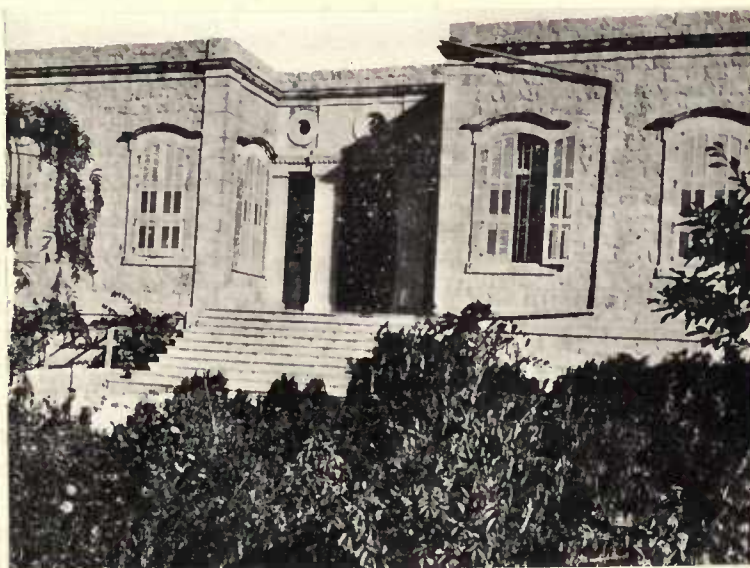
ABDUL BAHÁ'S HOUSE IN HAIFA