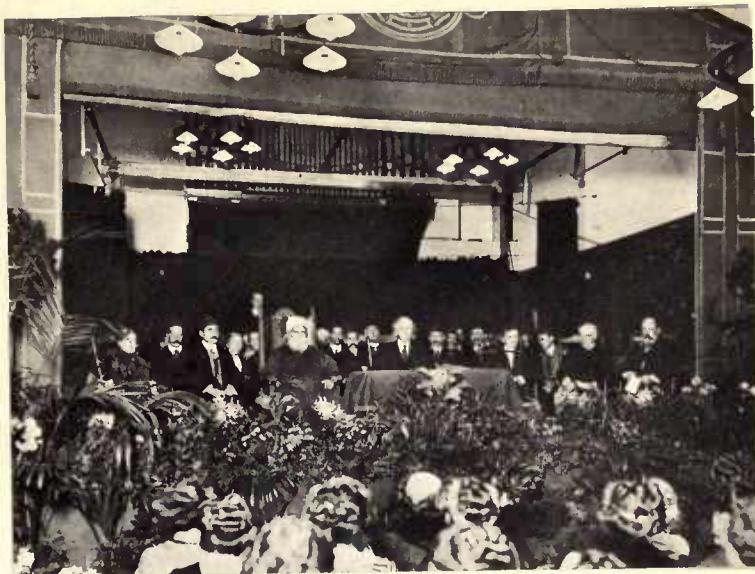
ABDUL BAHÁ IN A MEETING OF BAHÁIS IN LONDON