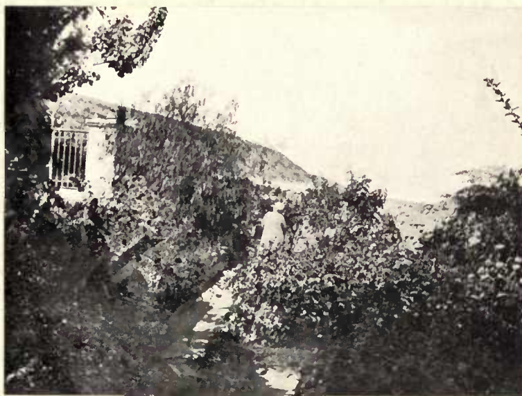
ABDUL BAHÁ WALKING IN HIS GARDEN IN HAIFA