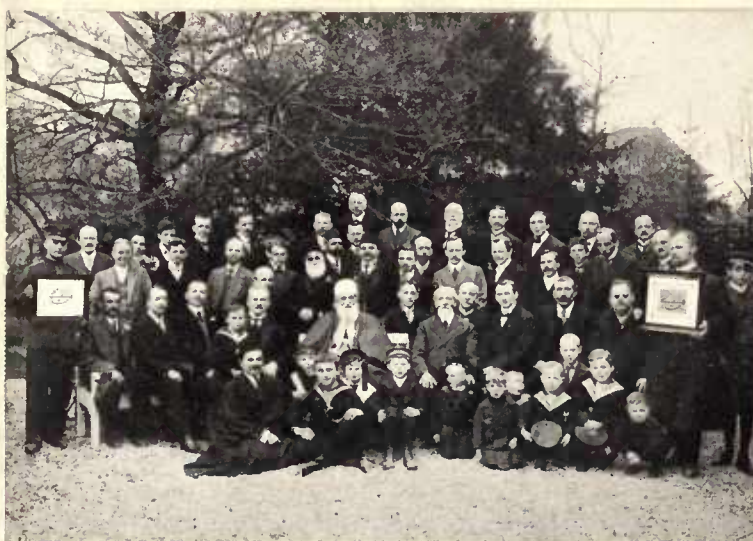
ABDUL BAHÁ WITH SOME OTHER BAHÁIS IN STUTTGART