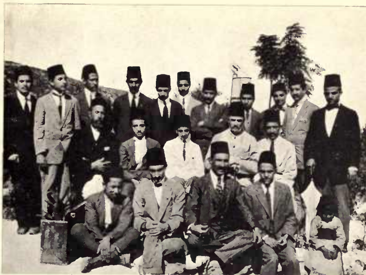
BAHAI STUDENTS ON MOUNT CARMEL