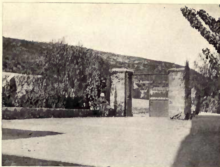
ABDUL BAHÁ SEATED WRITING WITHIN THE GATEWAY OF HIS HOME IN HAIFA