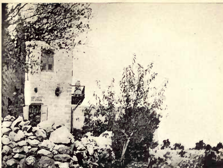
ABDUL BAHÁ ON THE BALCONY OF THE HOUSE ON MOUNT CARMEL