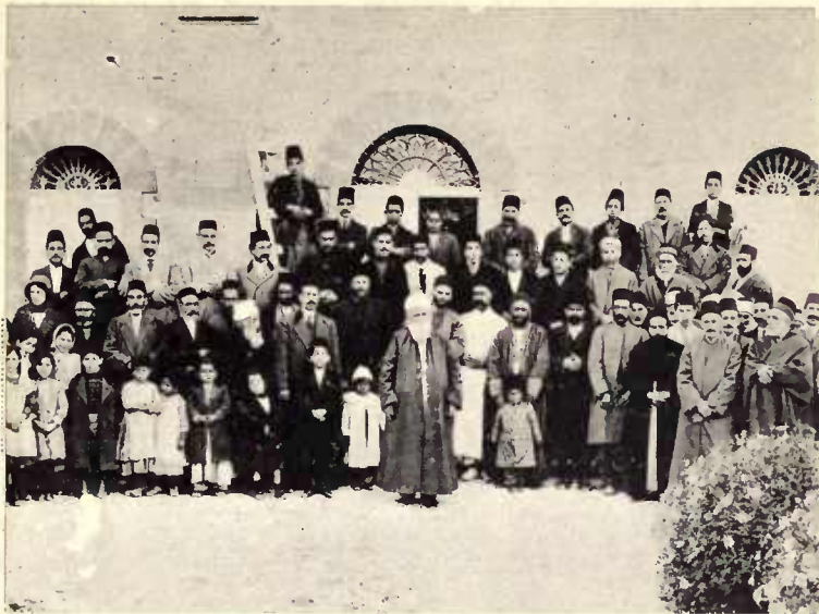
ABDUL BAHÁ AND A GROUP OF BELIEVERS AT THE TOMB OF THE Báb