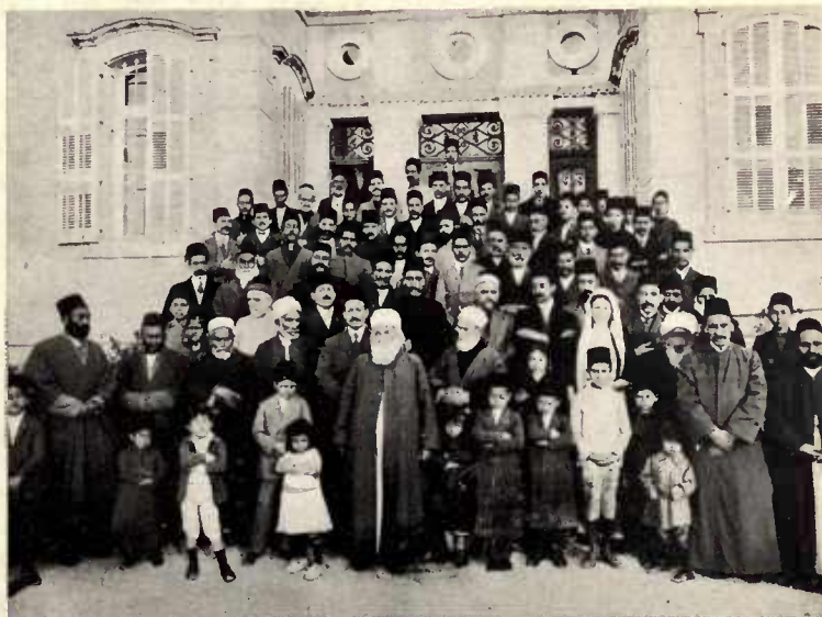
ABDUL BAHÁ WITH A GROUP OF BAHÁIS AT HIS HOME IN HAIFA