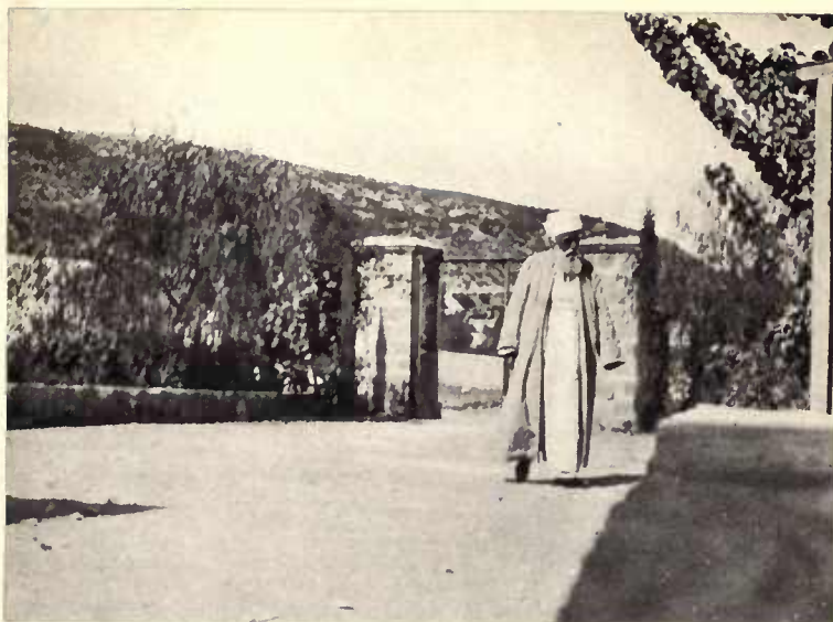
ABDUL BAHÁ ENTERING THE GARDEN OF HIS HOUSE IN HAIFA