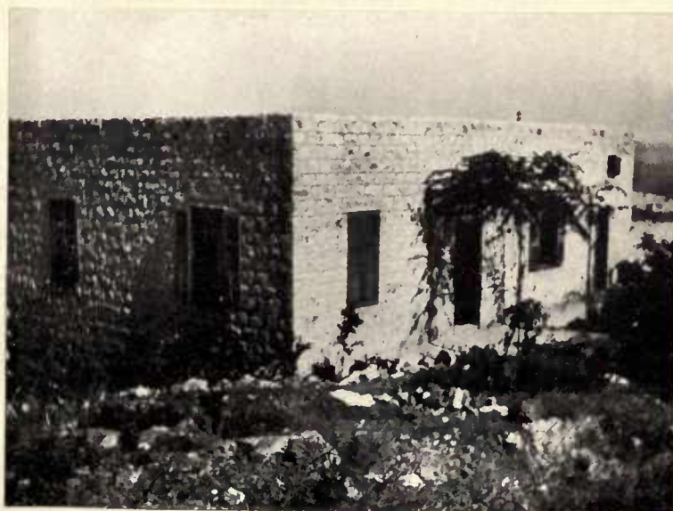
THE HOUSE WHERE ABDUL BAHÁ OFTEN STAYS ON THE SLOPE OF MOUNT CARMEL