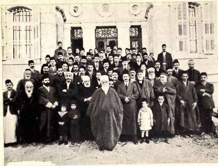
ABDUL BAHÁ WITH SOME OF HIS ORIENTAL FRIENDS AT HIS HOME IN HAIFA