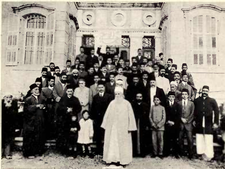
ABDUL BAHÁ WITH A GROUP OF BELIEVERS AT HIS HOUSE IN HAIFA