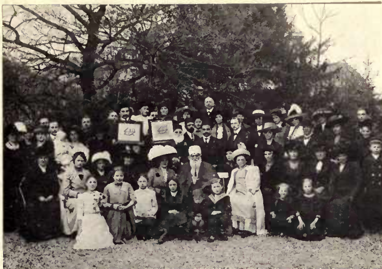
ABDUL BAHÁ WITH SOME BAHÁIS IN STUTTGART