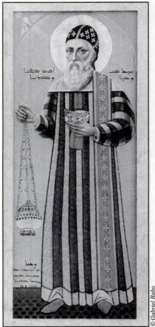
Syrian Orthodox Icon of St. Ephrem the Syrian (d. 373 CE) in the Mother of God Church, Monastery of St. Ephrem the Syrian, in Glane/Losser, the Netherlands. Based on the medieval icon (1218 CE) of St. Ephrem in the Theotokos Mother of God Church, Diyarbakir, Turkey. Photograph taken in 1995.